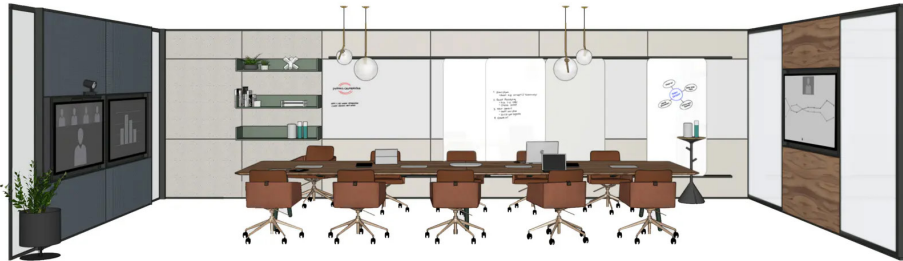
Reference layout: dual 65" displays + integrated video bar at the front, conference table for 12, touch controller on table, scheduling panel at door.

Mid-sized conference room for up to 12, built around a single Teams- or Zoom-certified appliance.