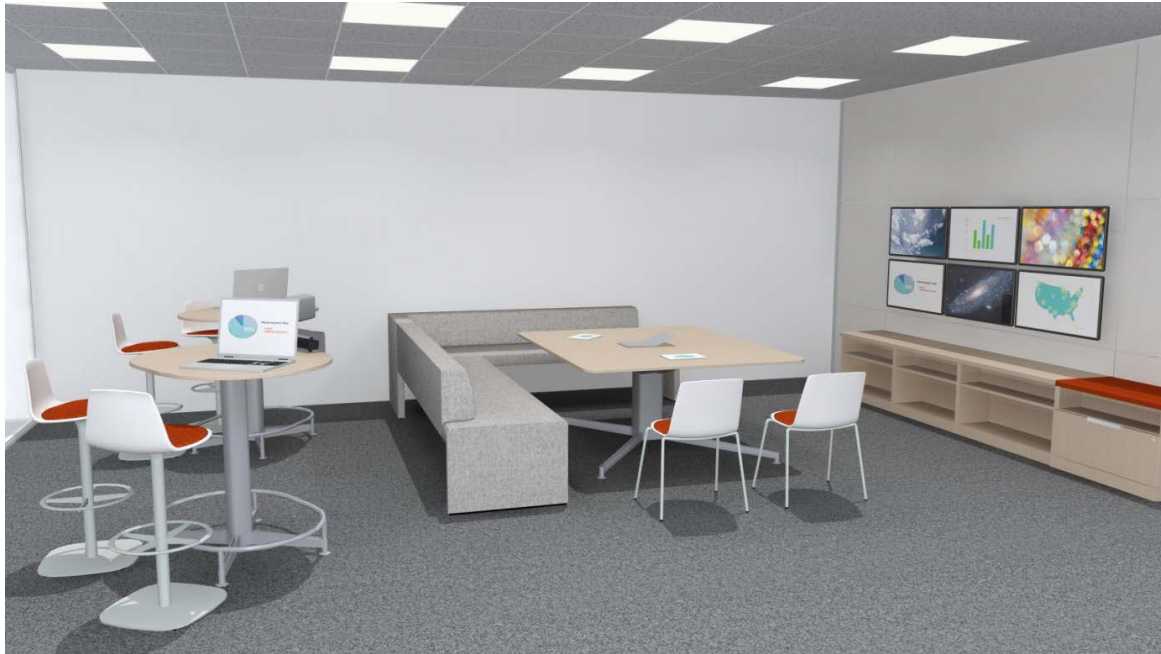
Reference layout: video wall displays, ceiling mics & speakers, PTZ camera, touch whiteboard, executive table.

Executive-ready space for up to 12+ attendees with video wall and one-touch join.